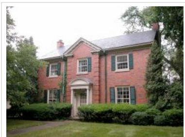
Donatelli Builders won the 2009 Dream Home Award with this dramatic makeover. Here is the front of the residence before the makeover.

Donatelli Builders, Inc., a full-service residential construction firm based in Wheaton, Ill., recently announced its win in a national building and design competition: the Dream Home Awards. Donatelli Builders, Inc. won in the category of best whole-house remodel 2,500-4,000 square feet.