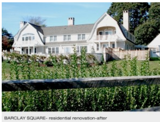
BARCLAY SQUARE- residential renovation-after